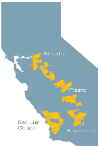
OnePac Office SHDSL is available in these markets

All of your telecom needs in one package — voice and internet access, free local calling and much more.