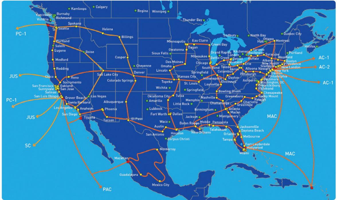
① Net Extended Reach connects all your locations nationally and internationally